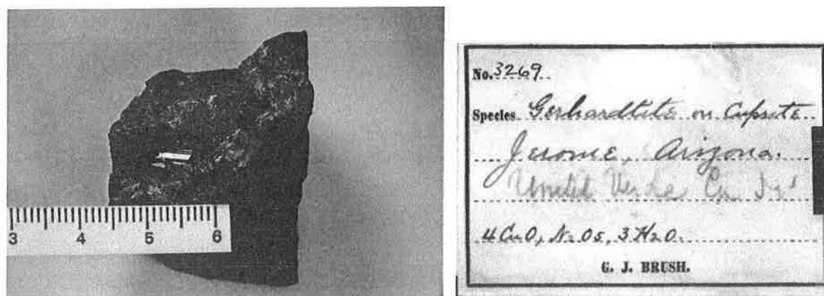
Figure 2. Gerhardtite type specimen (YPM MIN. 033269); scale bar in centimeters.

Gerhardtite, \text{Cu}_2(\text{NO}_3)(\text{OH})_3 (orthorhombic), the first new mineral described from Arizona, was published by Horace L. Wells and Samuel L. Penfield of the Yale Sheffield Scientific School (or simply "Sheff") in 1885. The specimen (Fig. 2), from the United Verde Mine in Jerome, Yavapai County, was left at Sheff by the mine assayer, G. W. Stewart. Wells and Penfield credit George J. Brush with recognizing it as a new mineral species. Another new mineral from Arizona, spangolite, \text{Cu}_6\text{Al}(\text{SO}_4)\text{Cl}(\text{OH})_{12} \cdot 3\text{H}_2\text{O} (hexagonal) (Fig. 3), was described in 1890 by Samuel L. Penfield. The precise locality of the holotype, although very likely Bisbee, Cochise County, will probably remain a mystery, because the Tombstone resident Norman Spang acquired it from could not remember the exact locality where it was found. Spang lent Penfield the specimen for study in 1889, and eventually presented it to him.